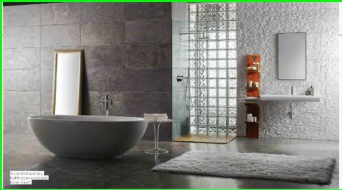
A contemporary bathroom concept from Ciraf.