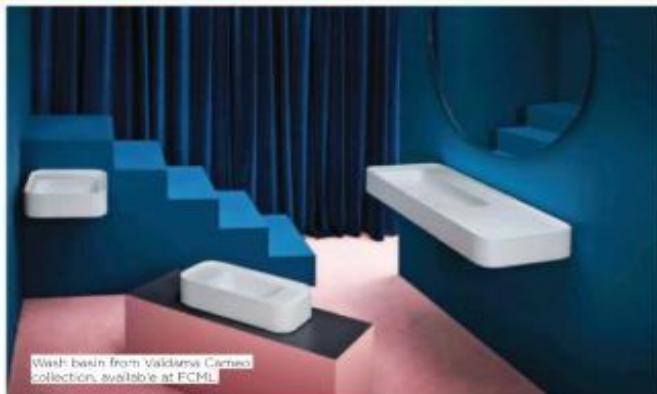
Wash basin from Valdama Ceramo collection, available at FCML.